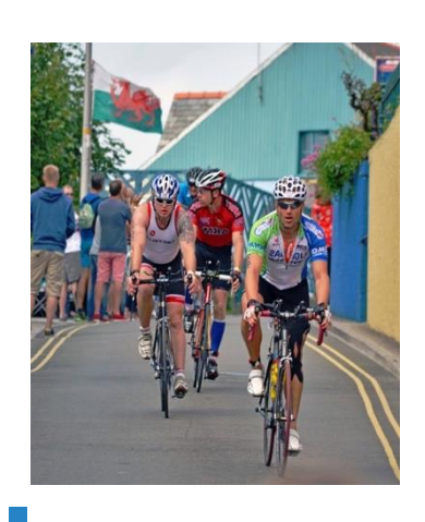
IRONMAN WALES September 11th 2022

With our popular sporting weekend coming up next month, Saundersfoot will be opening up the Sports Field to provide additional car parking facilities to accommodate spectators, competitors and locals alike and help the village become more accessible over that weekend. The car park will be run by volunteers of the newly formed Saundersfoot Football Team and 50% of the takings will go towards the organisation of local village events!